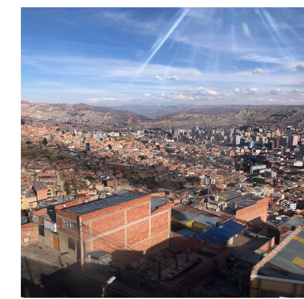
Picture taken in La Paz, Bolivia elevation 11,942 feet

Division of Biomedical Informatics and Personalized Medicine, University of Colorado Anschutz Medical Campus